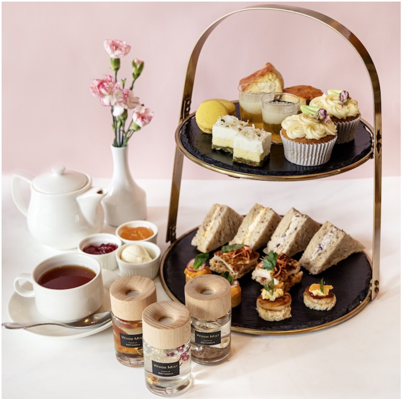
The 2D1N Revitalising Escapade includes an afternoon high tea session at The Marmalade Pantry

The 3D2N Holistic Retreat comes with a three-course dinner on the second evening at OSO Ristorante , an Italian fine-dining restaurant located on Level 27. Tuck into wholesome dishes such as Raw Tuna Loin Carpaccio marinated in beetroot, balsamico and orange; Cured Beef “Bresaola” Pear with Parmigiano; Flat Small Ravioli “Plin” filled with herbs, mixed vegetable ragout cooked “Bolognese” style; or Stewed Seabass Fillet with Smoked Eggplant Pulp, Sun-Dried Tomatoes and Lemon Zest. End on a sweet note with the 85% Venezuelan Single Origin Dark Chocolate and Black Cherries or the Double Cream Vanilla Flan “Panna Cotta” with Black Pepper Caramel Sauce, and wash it all down with a glass of Italian sparkling, red or white wine.